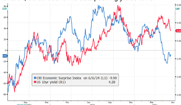
Chart 1; Softer economic data pushing yields lower

The market has moved to the Fed's thinking that the next rate move is down, and not up, with a string of weaker economic, activity and labour data supporting this. The string of weaker economic releases, and growth tracking around potential, will be welcomed by policymakers in their aim to get inflation down to target.