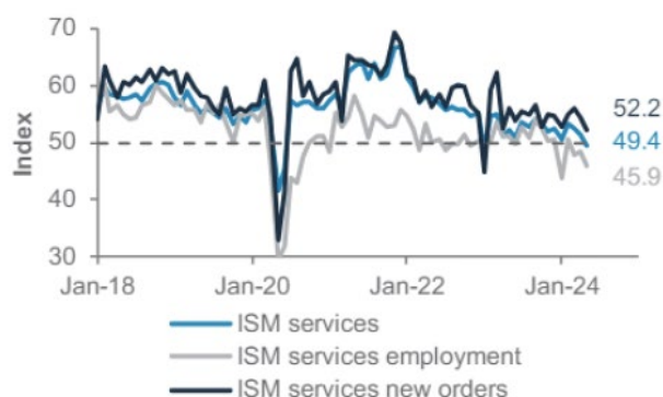
Chart 2; US ISM Services PMI

In the US, April non-farm payrolls were lower than expected at 175k (vs 240k expected), the second lowest print in the last 12 months. Year over year wage growth ticked down to a three year low of 3.9% (from 4.1%), helping to offset concerns over the slow last mile of the disinflation process. A downturn in US manufacturing and services activity, and new orders and employment components, also point to future labour market softness and a slowdown ahead in US consumption. Retail sales also cooled, with the core control group -0.3% in April vs 0.1% expected and 1.1% in the month prior. Lastly, May's Core PCE inflation data cooled to 0.3% month on month, in line with April, after 3 months of upside surprises in Q1.