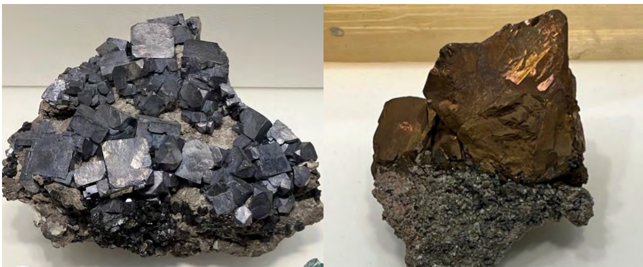
Lead ore (galena, left) from USA and more copper ore! (right). Chalcopyrite this time, a sulphide.