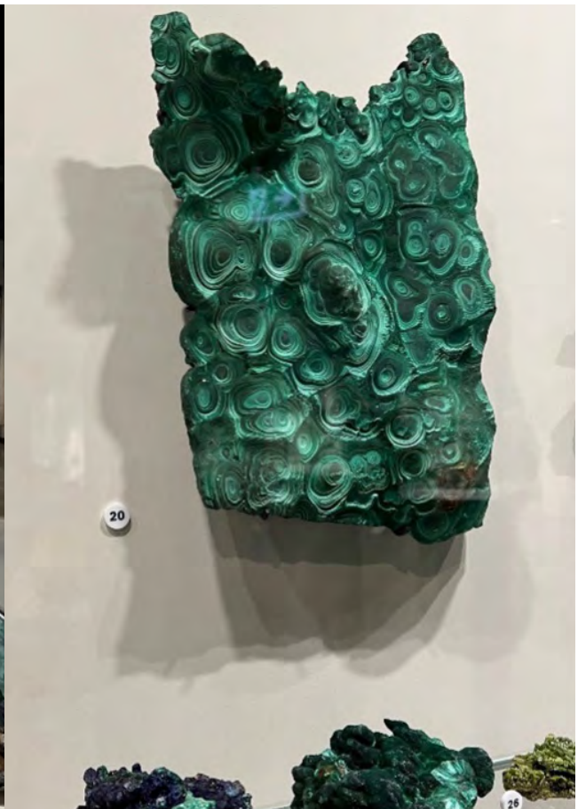
Variety of samples (left) and copper ore (right).