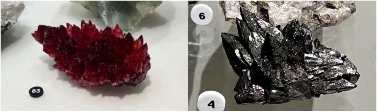
Rhodochrosite (manganese, left), a carbonate and cassiterite, or tin ore (right), an oxide, for making a different kind of tinnie (bronze, perhaps).