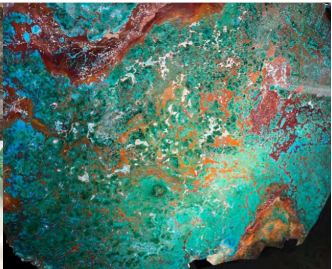
Copper sulphide ores from Australia. On the right is a polished 2 billion year old example from Sandfire's DeGrussa mine in WA.