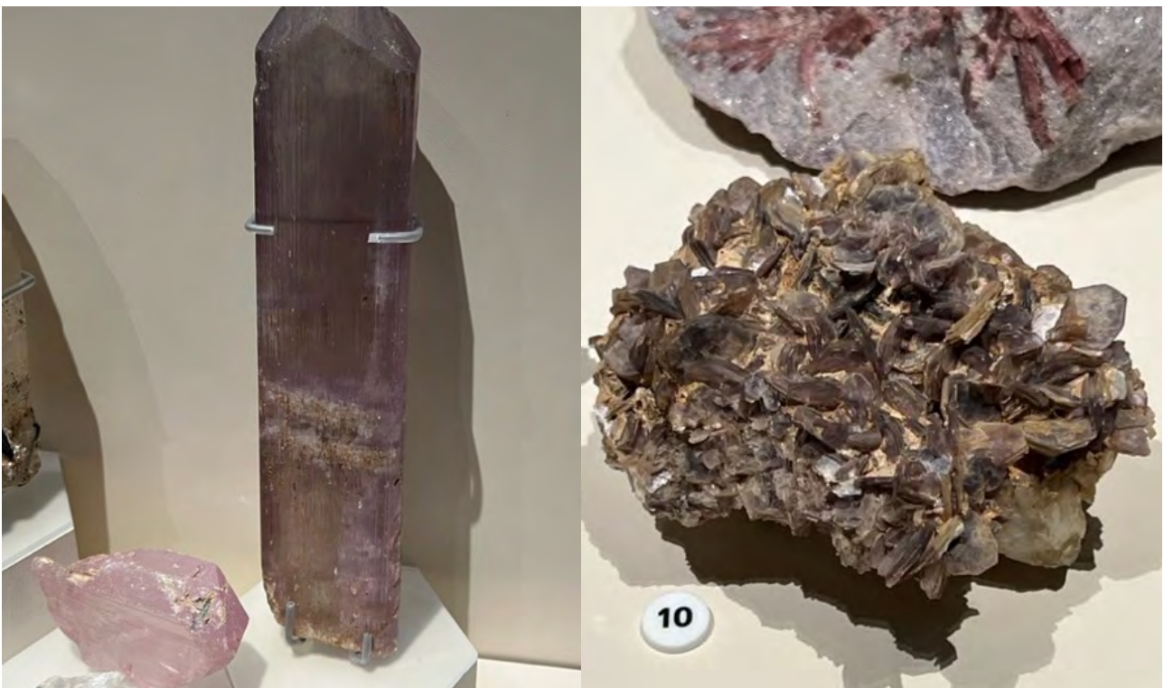
Spodumene (left) and Lepidolite (right).

Lithium is of particular interest for batteries because it is light and so has such a high charge-to-weight ratio. This results in faster charging and longer use. The power density makes it ideal for small applications, like phones, as well as bigger ones, like cars. Australia is currently the world’s second biggest producer of lithium (hard rock/spodumene in pegmatite) behind Argentina (brines/dissolved lithium).