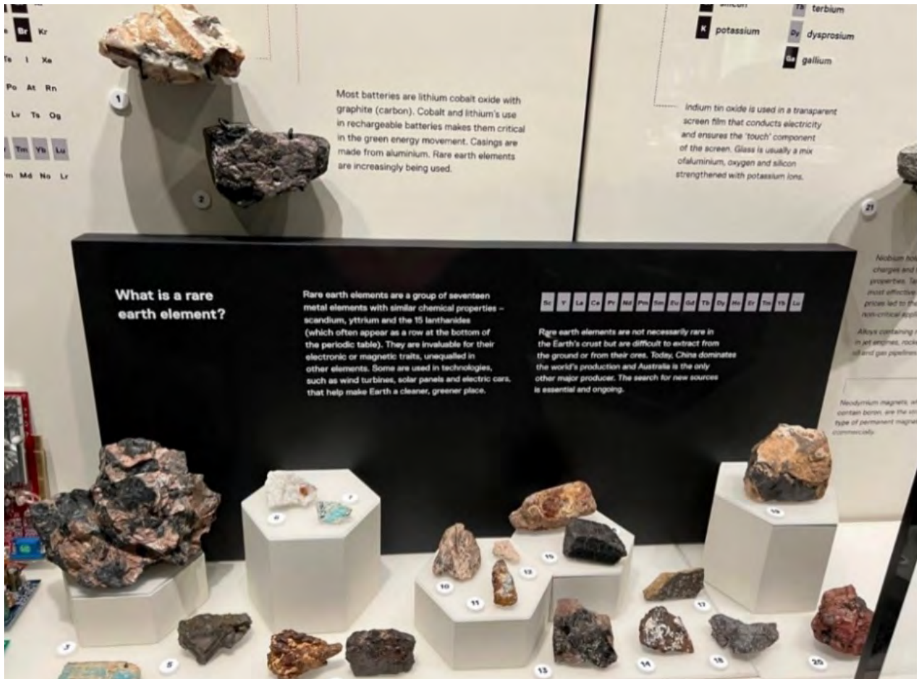
Rare earths on display.

“New materials” also cover Rare Earths, a group of 17 heavy metals. These materials have really come into our consciousness over the past 15 years or so due to technological advancements in motor vehicles, renewables and military applications. 70% of these minerals are produced in China but there are important suppliers outside that country including Australia’s Lynas Rare Earths (~6%).