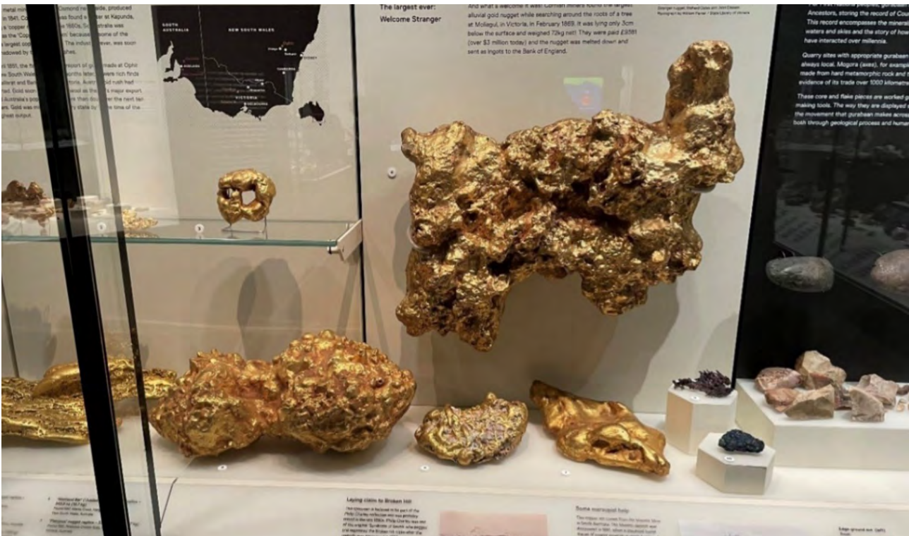
Gold nuggets, larger ones are replicas.

lower concentrations of gold. Gold mining often requires huge material movements and extensive processing, sometimes very extensive processing, as is the case with refractory ores. Nuggety deposits do exist, for example around Ballarat in Victoria, and they can present their own challenges, like accurate resource estimation. Exploration drilling through coarse gold can lead to an overestimation of contained metal (it has happened in the past) and is not something you'd want to discover once mining had commenced.