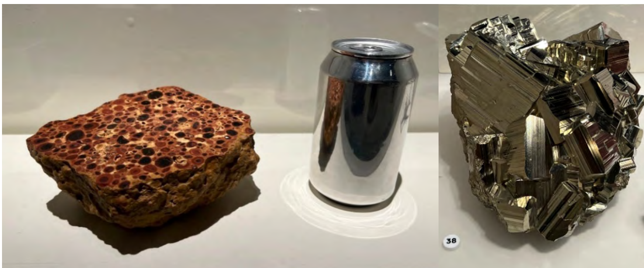
Bauxite (aluminium, left) converted into a tinnie. Spectacular but less obviously useful is pyrite (iron sulphide, right), or Fools Gold, which is used to make iron sulphate for applications in agriculture.

Space is too limited here to cover base metals in any detail so below are a few examples of the common types. The list is not exhaustive but gives a flavour for the variability of mineralisation in the Earth's crust.