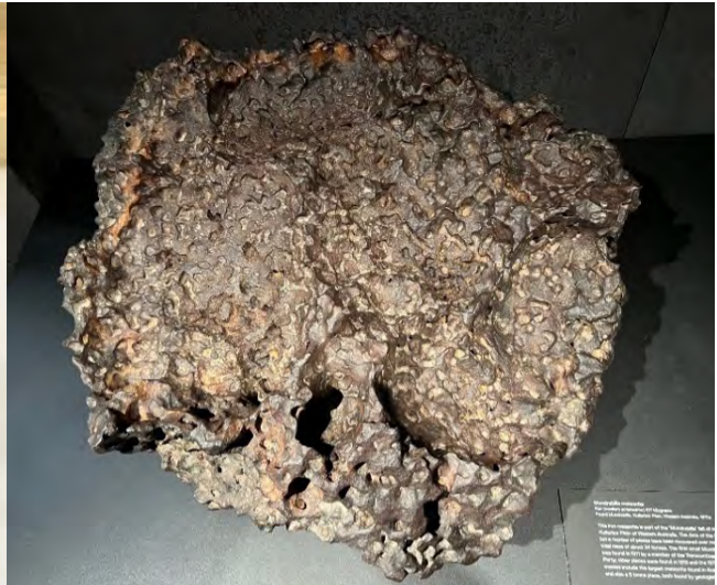
An exotic example of hematite (terrestrial, left) and a 617kg iron meteorite (right) recovered from the Nullarbor.