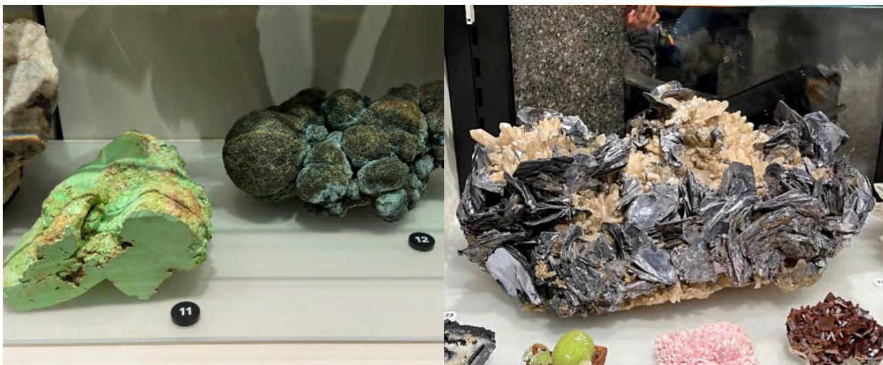
Nickel ores from WA (left) and molybdenite from NSW (right). Both are common coating and alloying metals, and nickel is finding increasing application in battery technology.