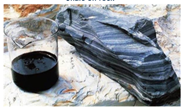
Shale oil rock

average traditional oil reserve depletes at a rate of approximately 10% pa. requiring producers to replace those deposits with new exploration and discovery every ten years or so. Shale reserves have proven to be less sustainable. As opposed to an annual 10% depletion rate, Shale has been shown to deplete at an annual rate of 70% requiring new deposits to be identified every 12-18 months in order to maintain output.