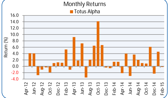
Chart 2: Monthly Returns