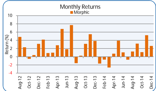
Chart 2: Monthly Returns