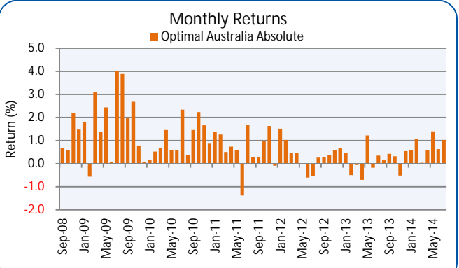
Chart 3: Distribution of monthly returns